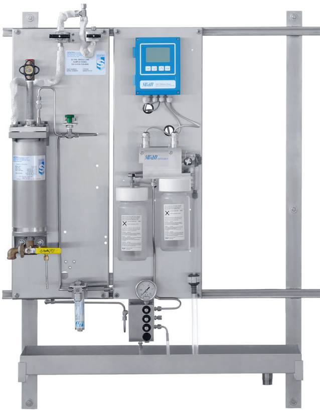
SLP - frame for wall-mounting with optional SWAN analyzer AMI Deltacon Power