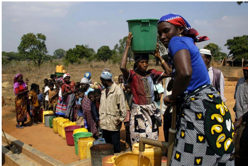
Caption: Women and girls are primarily responsible for fetching water

Helvetas , an organisation for international development, implements construction projects in cooperation with local inhabitants in 20 of the poorest countries. Typical Helvetas projects are: construction of drinking water supplies, connecting paths and bridges and education. Helvetas' work is financed by donations from the public and by the Swiss Government.